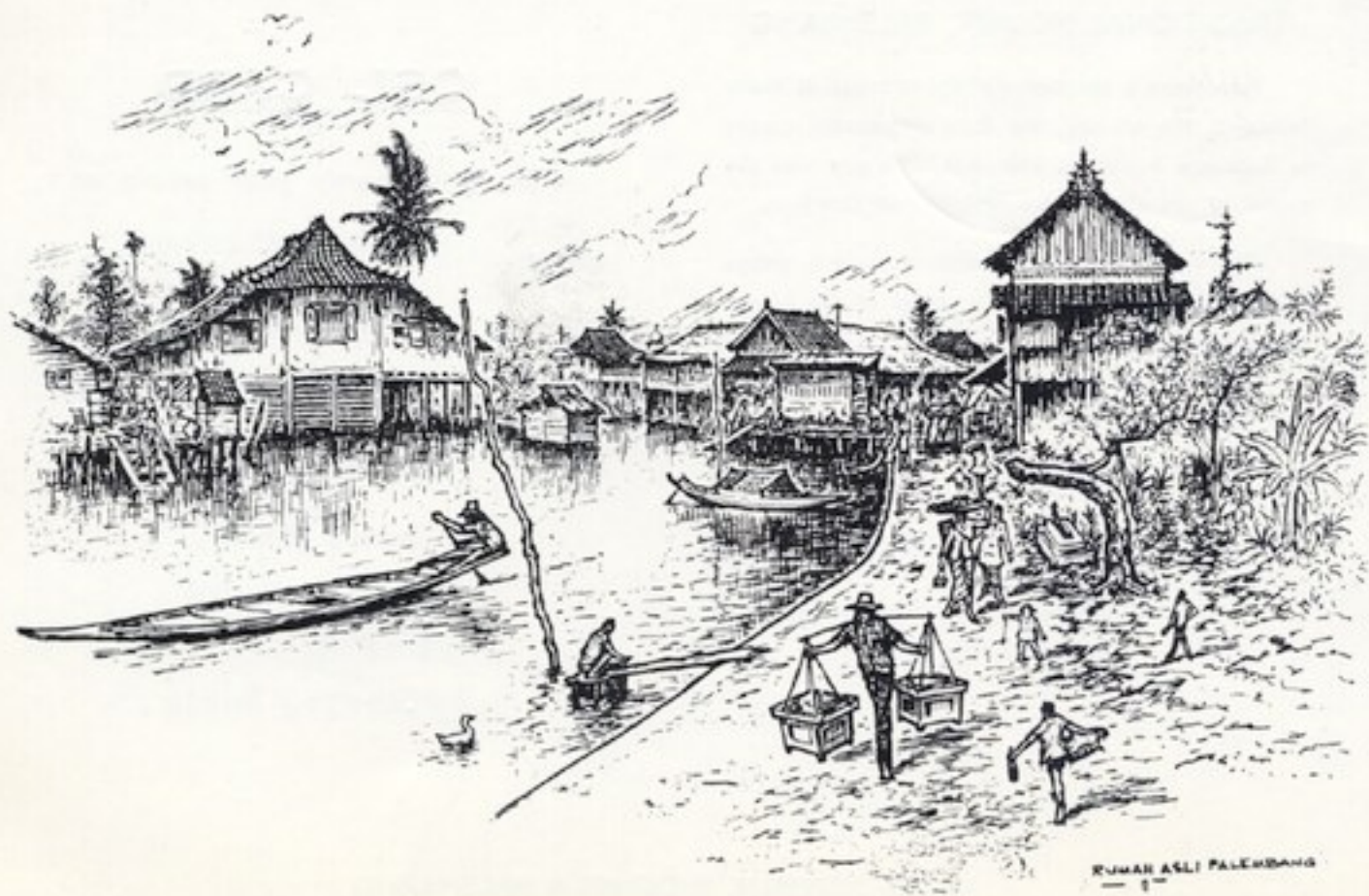
RUMAH ASLI PALEMBANG