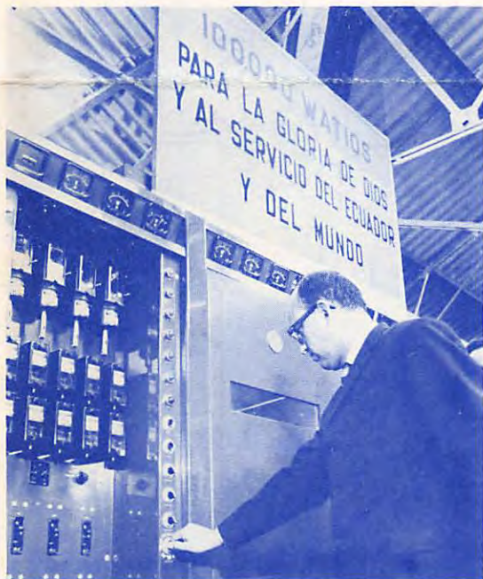
Dedication of HCJB's 100 kw Xmtrs.

It's exciting to review the 45 years of HCJB's history. We say that, not because we have done great things, but because we have seen God's hand upon HCJB. Consequently we have witnessed one of the great breakthroughs of this century – missionary radio which spans the globe.