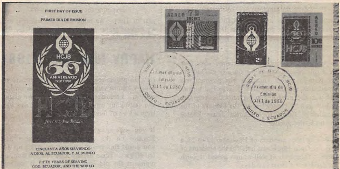
HCJB's 50th Anniversary First Day Cover