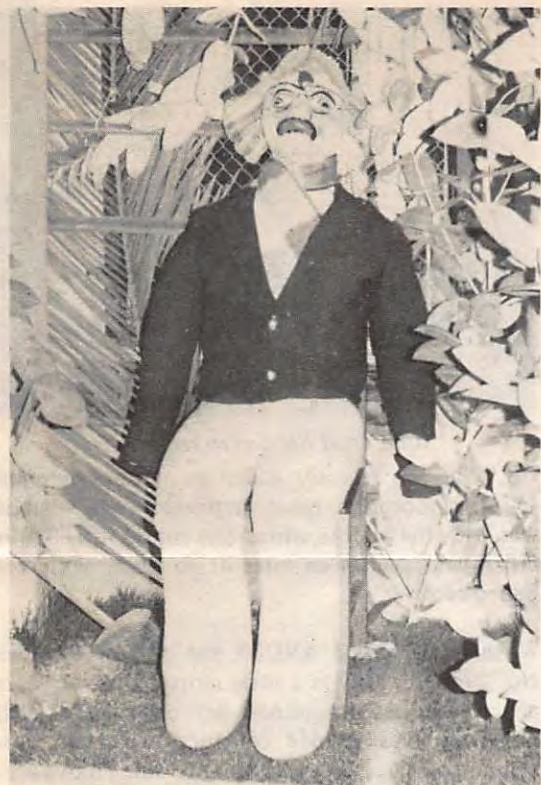
A typical "Old Man" for New Year's Eve

live, ANDEX wants to wish you the very best for 1981. ANDEX has just completed seven years of life so this is a new year for our club, as well. We look forward to our eighth year and expect it to be one of our best ever. HAPPY NEW YEAR, and may the Lord prosper you in every way during 1981!