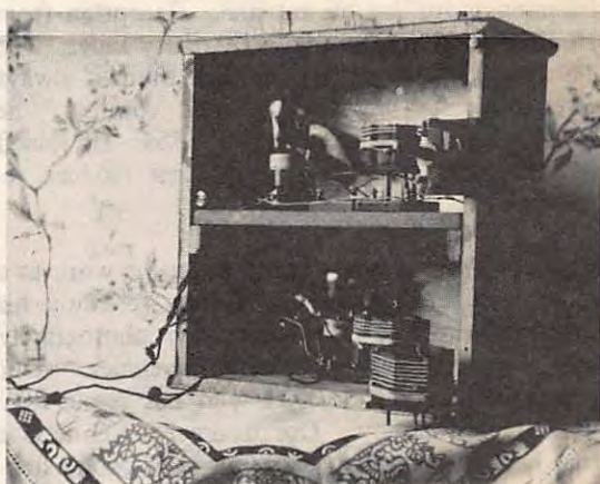
Inside the homemade receiver

by today's standards, but very typical half a century ago. Of course all the power was provided by batteries. There weren't many manufactured sets around in those days and numerous shortwave fans got their start on similar equipment!