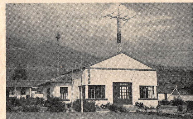
HOME OF THE 10 KW. HCJB TRANSMITTER

our programs are tuned in on 31 meters on our second station. Internationally, HCJB is heard on 12½ megacycles with a 10,000 watt station using a directional beam antennae which can be rotated to point its beam on any part of the globe.