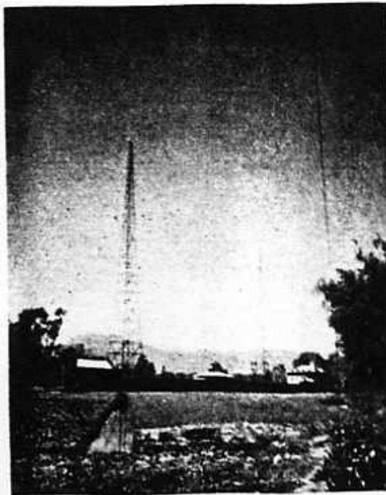
The antenna of the stations XEB and XEBT, Mexico City.

Station HII , Santo Domingo, R.D., is being heard on 10,040 kc (29.88). Address Apartado 577. It is not yet known if it is a broadcasting or phone station.