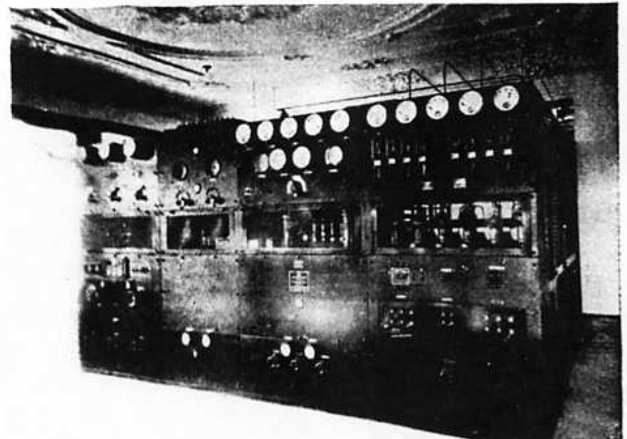
Transmitter and control panels at station XEB, Mexico City.

A new station IRY , Rome, is on or near 16,107 kc (18.62 meters) mornings and early P.M. phoning Cairo, Asmara