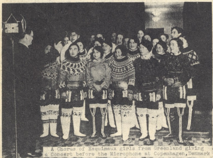
A Chorus of Esquimaux girls from Greenland giving a Concert before the Microphone at Copenhagen, Denmark