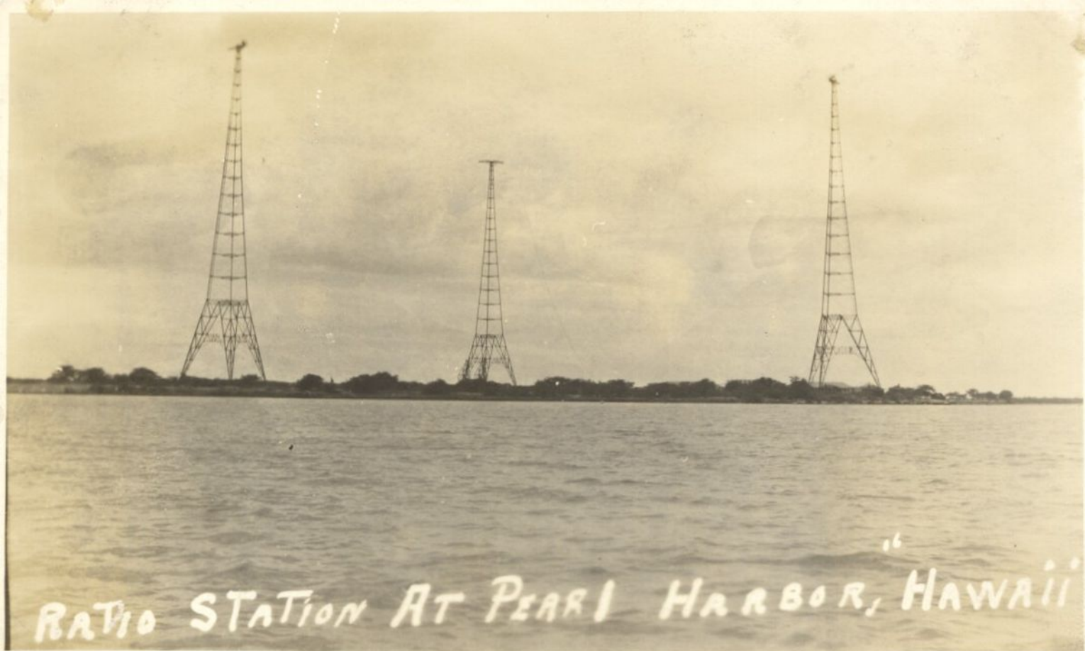
RADIO STATION AT PEARL HARBOR, HAWAII