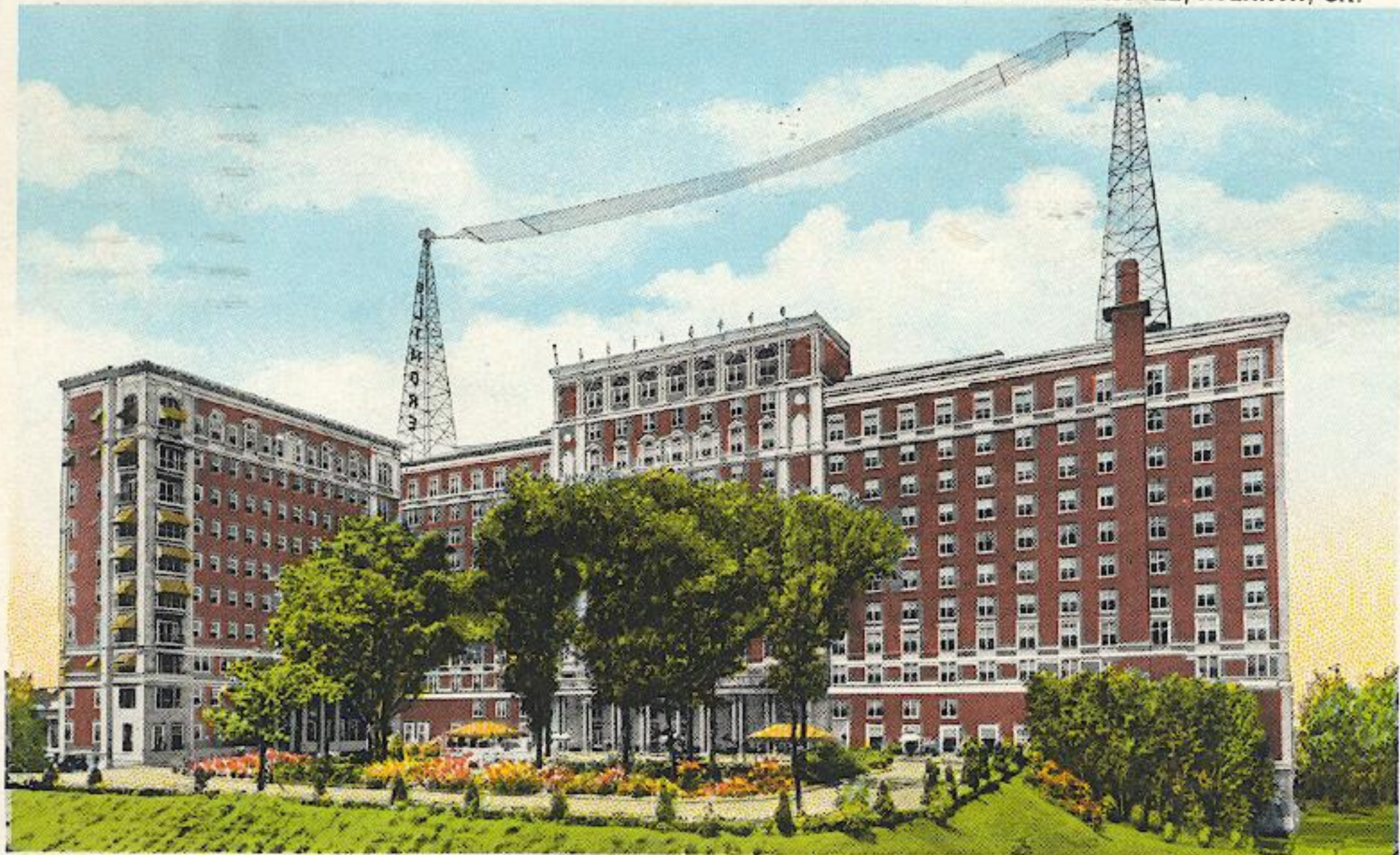
ATLANTA BILTMORE HOTEL, ATLANTA, GA.