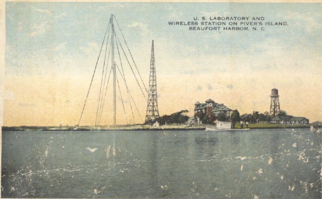
U. S. LABORATORY AND WIRELESS STATION ON PIVER'S ISLAND, BEAUFORT HARBOR, N. C.