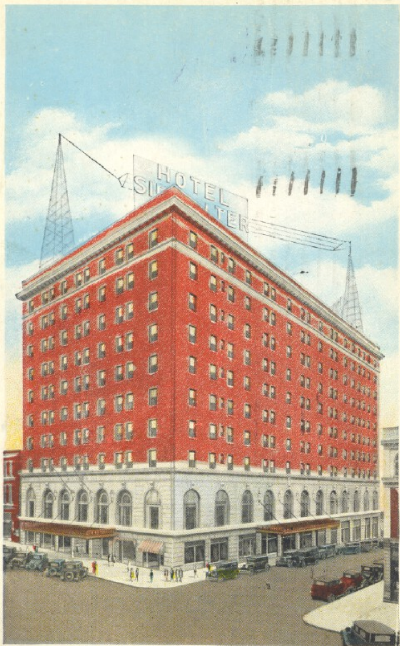
SIR WALTER HOTEL AND ANTENNA OF RADIO STATION W. P. T. F., RALEIGH, N. C.