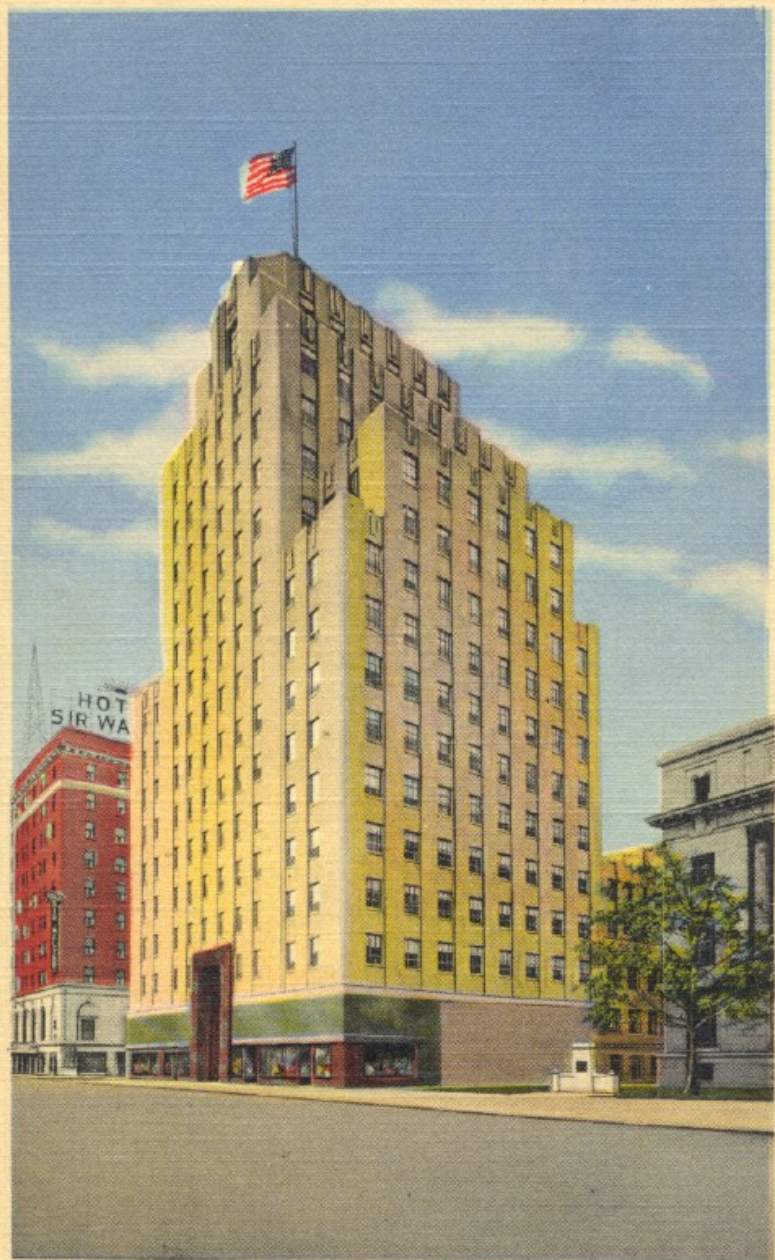
Also Home of Radio Station WPTF, 50,000 Watts