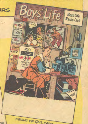
FRONT OF QSL CARD

B BLANK QSL CARDS SUITABLE FOR SWL'S AND HAMS. CALL LETTERS, NAME AND ADDRESS, ETC., MAY BE RUBBER STAMPED OR IMPRINTED. SEND IN COUPON B, BELOW.