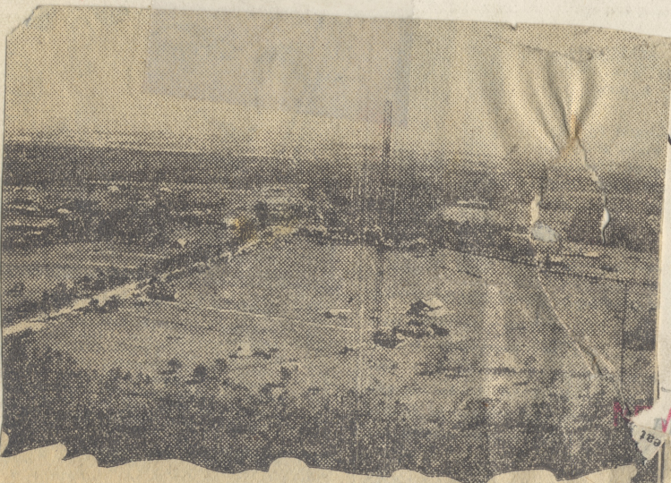
Aero view of A.W.A. Radio Centre, Pennant Hills. Messages to the Southern Cross were transmitted continuously from VIS at Pennant Hills.