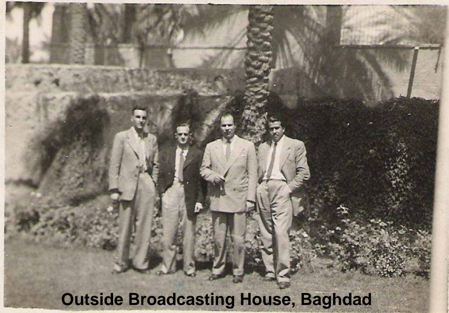
Outside Broadcasting House, Baghdad