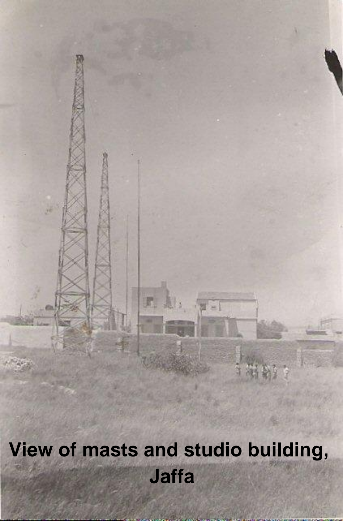
View of masts and studio building, Jaffa