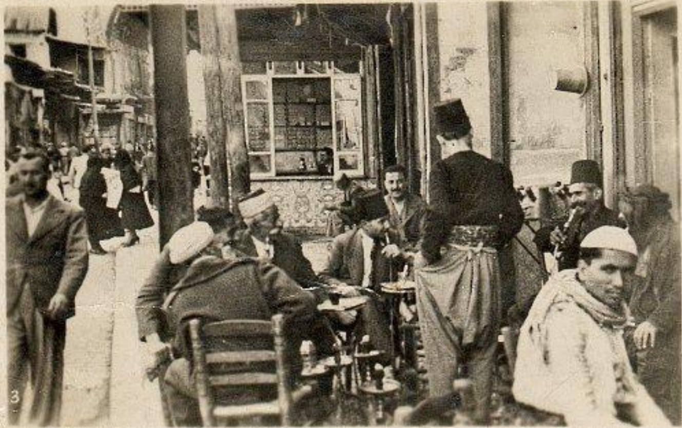
Jaffa cafe 1946