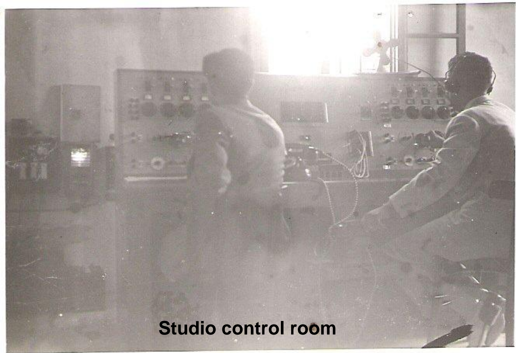
Studio control room