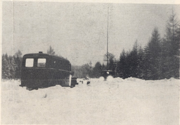
With your donations RFR Antenna mast can grow taller and stronger.