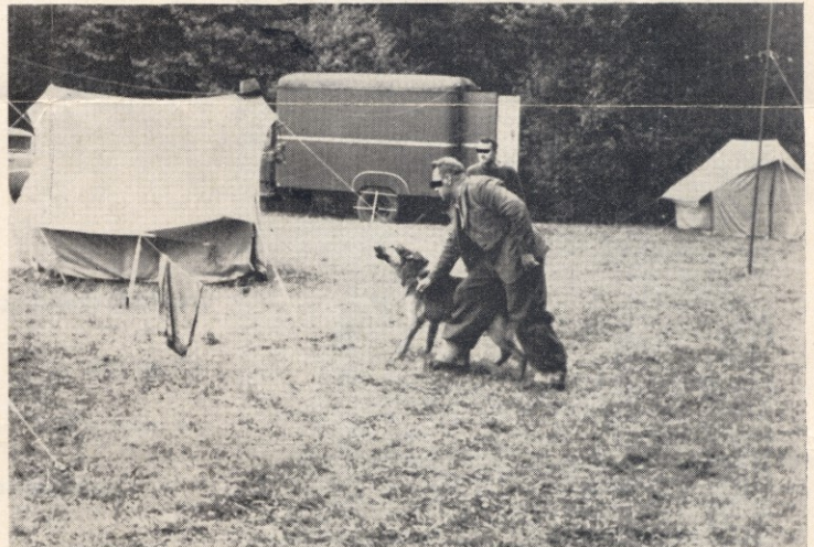
He is in the anti-communist movement too

Donations may be sent to the Swiss Bank Corporation, Basle, Bank Account No. 461971 for NTS "Free Russia".