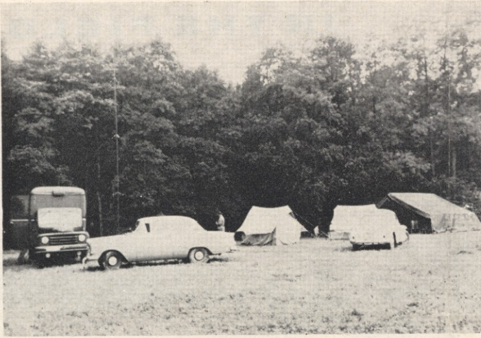
This is not a nomad or gypsy colony, this is Radio Free Russia in action