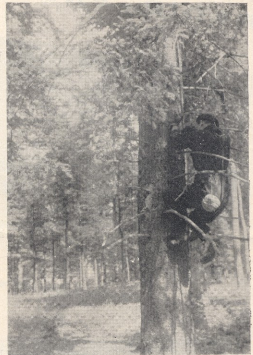
Ah! a ready made antenna pole.