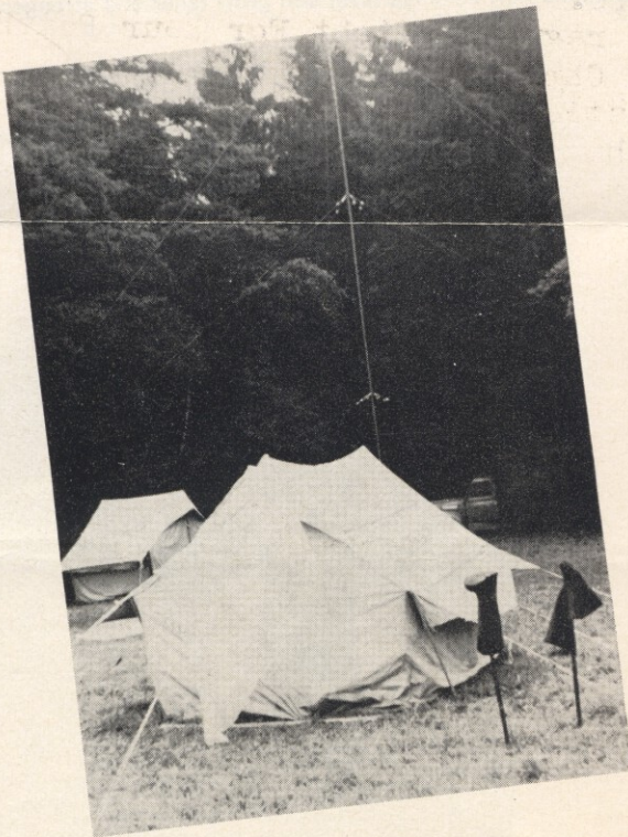
It's not home sweet home but the RFR broadcasts stay on the air.