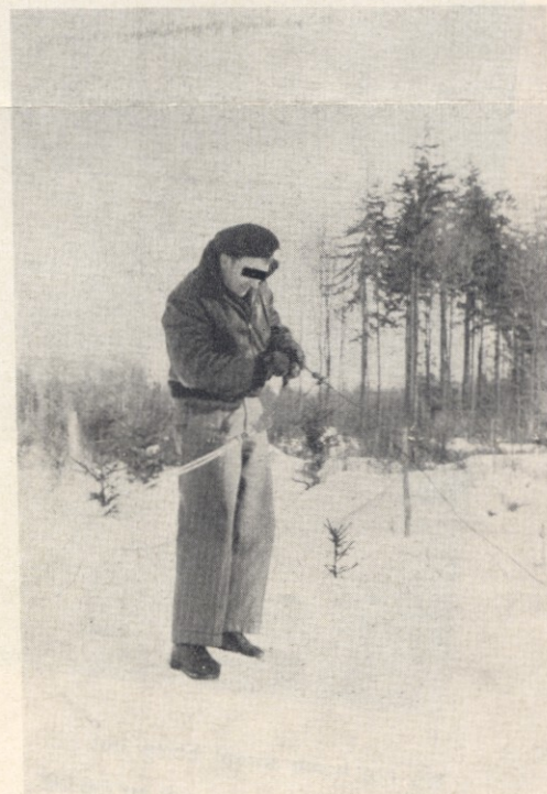
Can't let a loose connection work for Mr. Khrushchev.