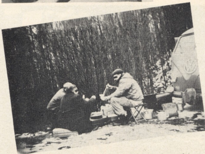
Boy, do I miss my wife's cooking back home.

Donations may be sent to the Swiss Bank Corporation, Basle, Bank Account No. 461971 for NTS "Free Russia".