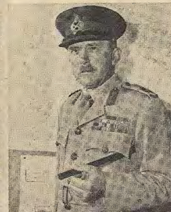
Lieutenant-General Frank Horton Berryman.

as great as during the first fifty years of Federation."