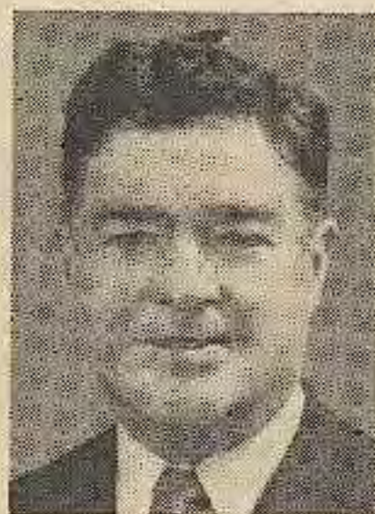
Hon. H. L. Anthony, Postmaster-General

Australia's Overseas Service is carried on by three high-powered transmitters located at Shepparton, Victoria, and it is through the medium of this service (known to world listeners as "Radio Australia") that we try to give a picture and tell the story of Australia and its way of life.