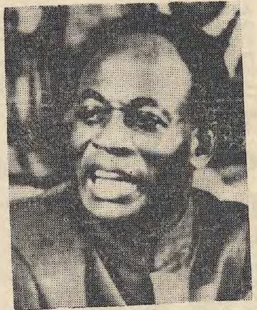
● Late Dr Kwame Nkrumah

This, he said, earned the late President the unsurpassed glory of leading the first Black African nation after Liberia, completely out of direct foreign rule and domination.