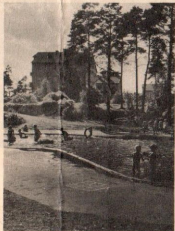
Summer in town