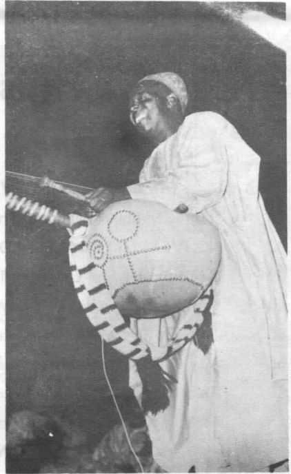
Africa musical instruments from Mali and Gabon respectively