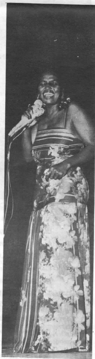
Marian Makeba, a South African artiste of international repute performing in Lagos during 'FESTAC '77.' She has since 1968 been residing in Guinea.