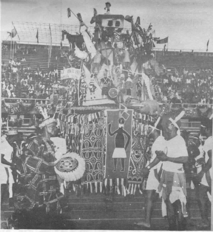
"Ijele Umuleri" masquerade from Nigeria.