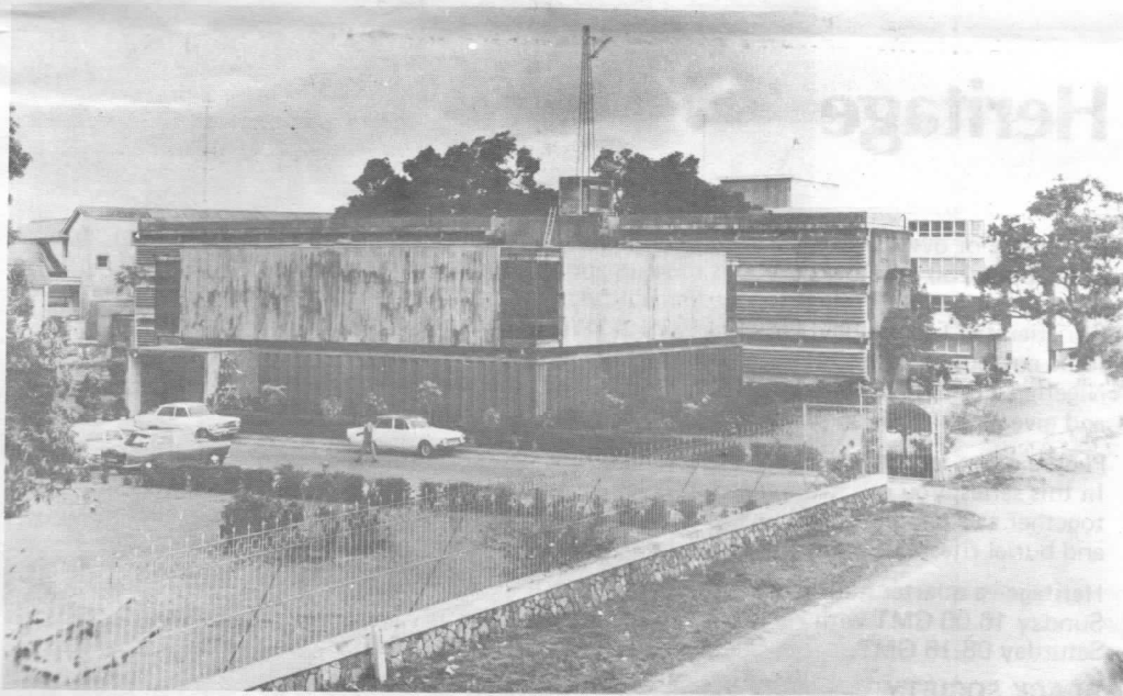
Front View of the 'External' Building at Ikoyi, Lagos, where VON programmes are being planned and produced.