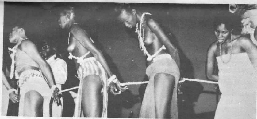
Artistes from Republic of Benin demonstrating the plight of slaves at the FESTAC.