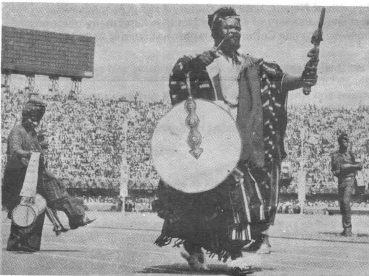
A renown Nigerian dramatist, Mr. Duro Ladipo in action at the opening of FESTAC '77 held in Nigeria from 15th January to 12th February this year.

The programme 'Nigerian Composers' will be heard once a week on Wednesdays at 18.00 hrs. G.M.T. with emphasis on the full works of leading composers.