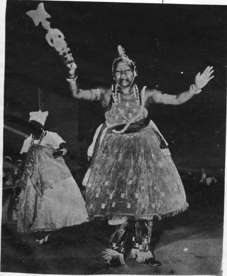
Omo Alaketo dancers from Brazil