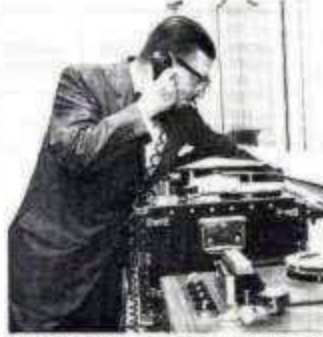
DIRECT REPORT FOR RNYW NEWS

United Nations, New York O.A.S. in Wash., D.C. IT & T AT & T RCA Communications New York & American Stock Exchanges