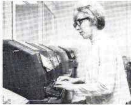
RCA & ITT TELEX