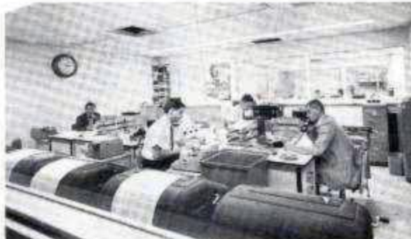
NEWS CROSS CHECKED WITH OUTSIDE SOURCES