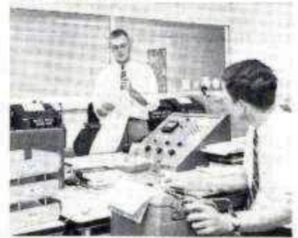
THE HOT LINE