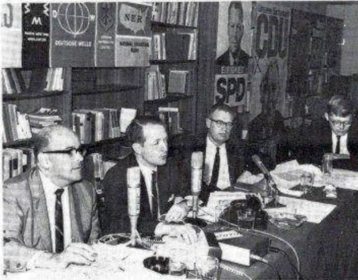
Three broadcast organizations pooled facilities to present coverage of the Federal German election returns to 70 North American radio stations.