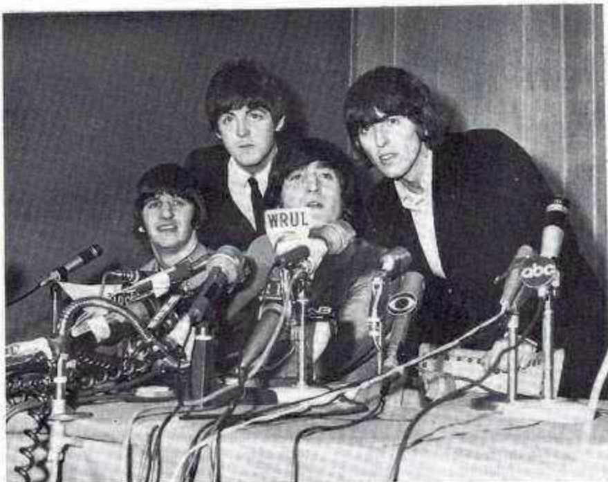
RNYW's four man team assigned to cover the Beatle's second New York visit found the crush similar to the traffic jams following the Shea Stadium concert by the Liverpudlians.