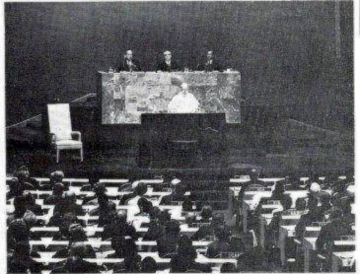
Simultaneously, Spanish, English and Portuguese translations of Pope Paul's visit to the U.N. were channelled by RNYW to local stations.