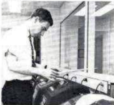
CONSTANT NEWS WATCH